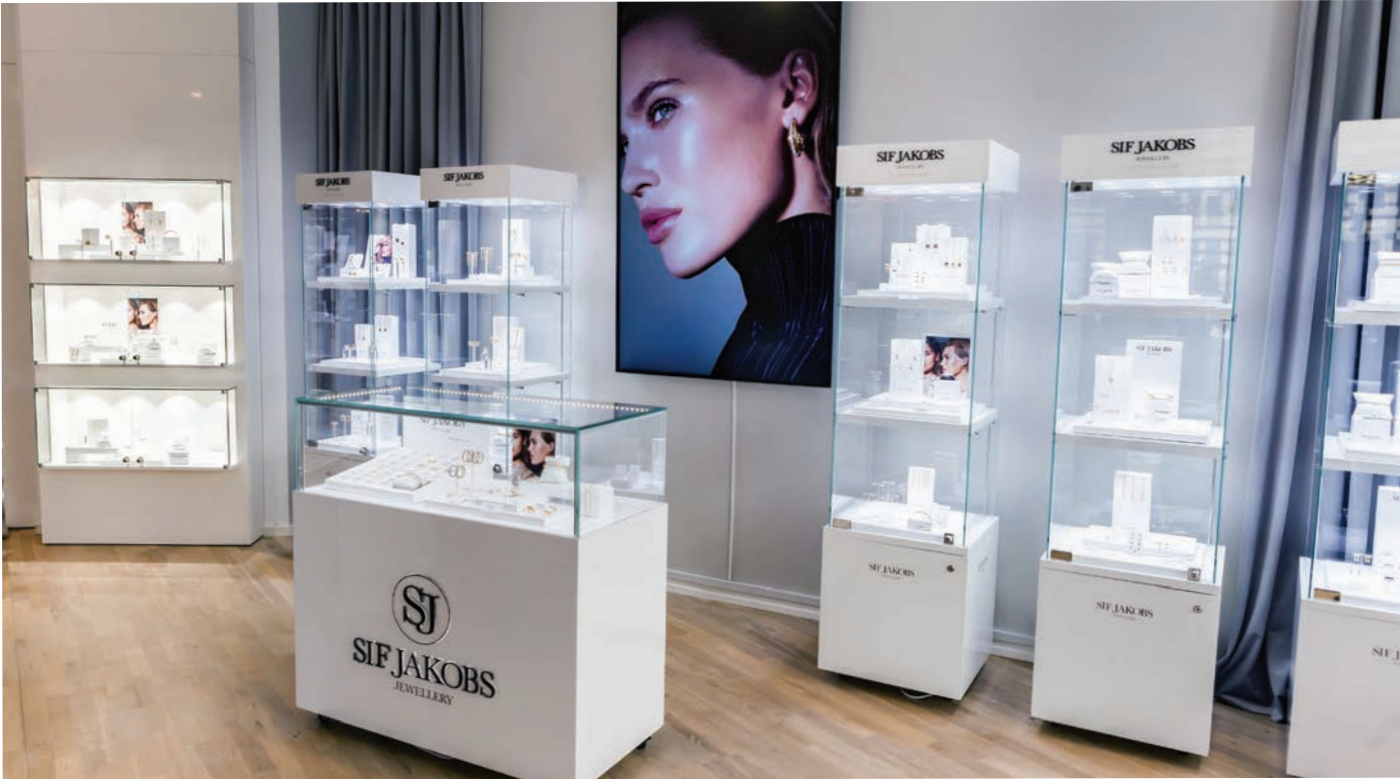
Back Wall - Counter Showcase - Triple Showcase